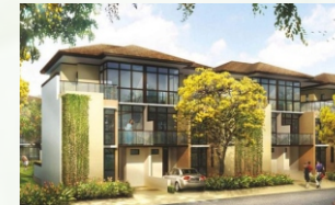
Luxury Premium Villas