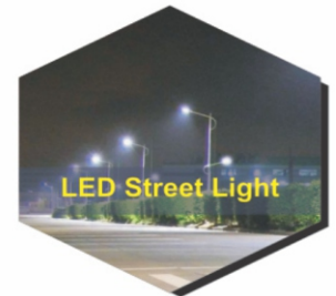
LED Street Light